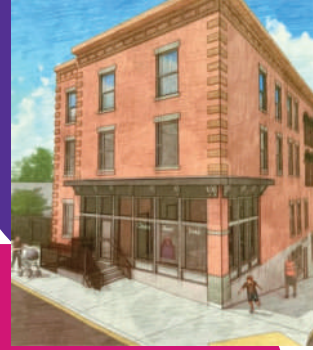
A rendering, by Lab 8 Designs, of Casa San Jose's planned community center in Beechview

In the new space, scheduled to be completed in late 2026, Casa San Jose will offer critically needed education, medical, advocacy, and recreational programs.