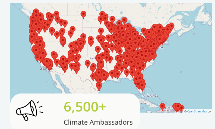
Map: Climate for Health Ambassadors (Subset of ecoAmerica's full Ambassador network)

Our Climate Ambassadors program is tailored for each sector and partner and includes in-person and online LMS training and a community platform (Forj) to keep Ambassadors engaged and informed. We also offer them opportunities for advocacy and action. Over 6,500 people have completed the 3-hour training program. In 2024, they averaged 12.8 advocacy actions engaging over 600,000 people. Examples: NACCHO , AME , and LULAC . We aim to double the reach of the program in 2025.