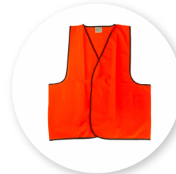
Workwear Hi-Vis Vest