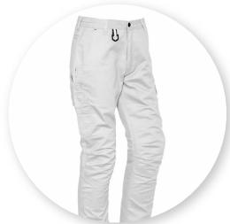
White Workwear Pants