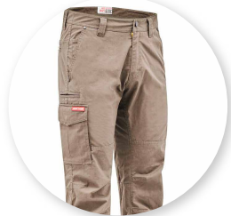
Brown Workwear Pants