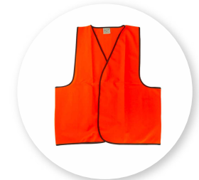
Workwear Hi-Vis Vest