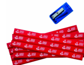
Pencils and Sharpener