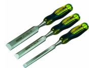
Wood Chisel Set