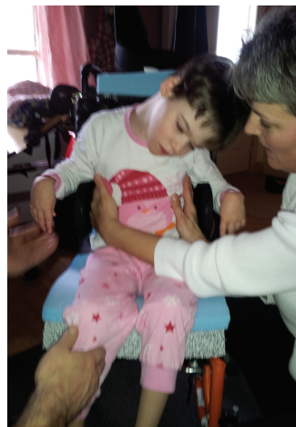
Translating seating into a wheelchair.