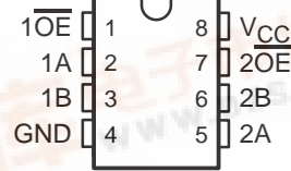
D OR PW PACKAGE (TOP VIEW)