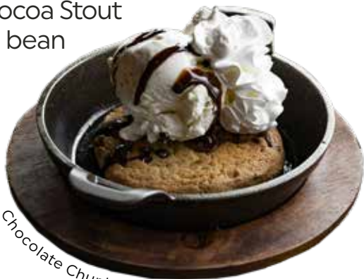
Chocolate Chunk Skillet Cookie

Round Barn Float 9 Oronoko Cocoa Stout with vanilla bean ice cream