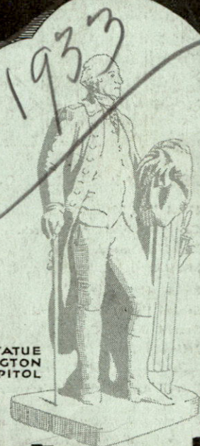
HOUDON'S STATUE OF WASHINGTON IN STATE CAPITOL