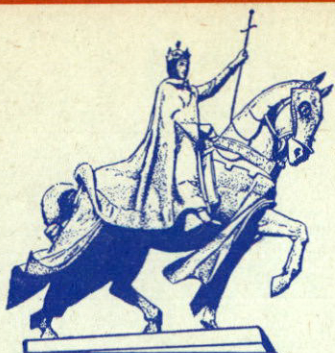
STATUE OF SAINT LOUIS