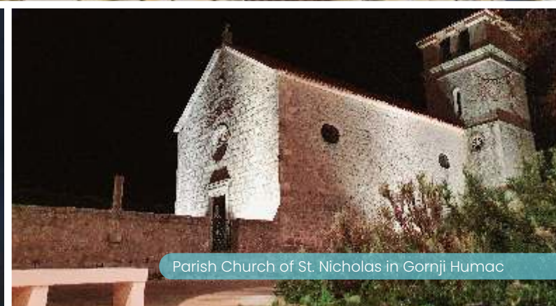
Parish Church of St. Nicholas in Gornji Humac