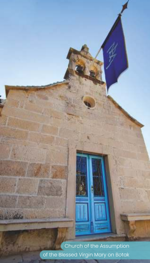
Church of the Assumption of the Blessed Virgin Mary on Botak