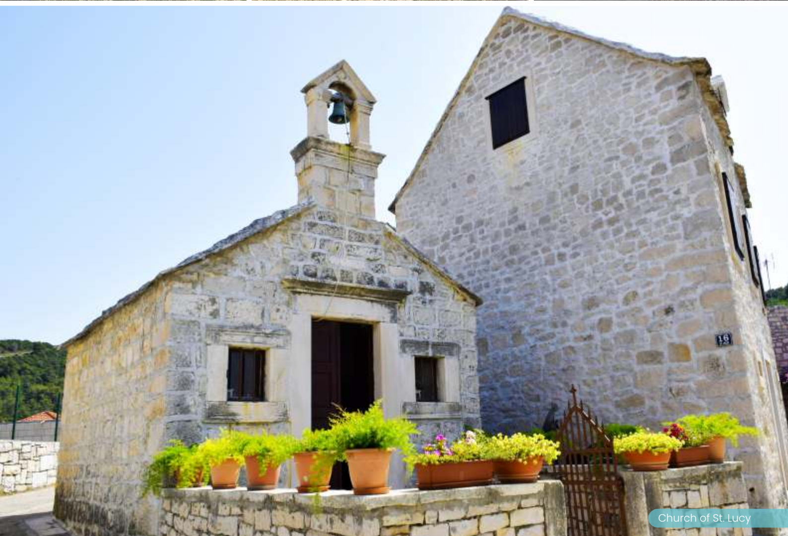
Church of St. Lucy