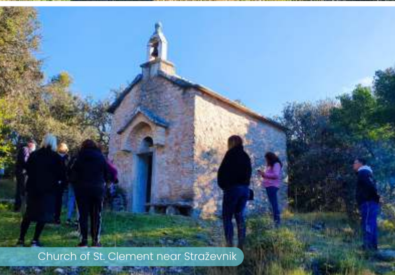
Church of St. Clement near Straževnik