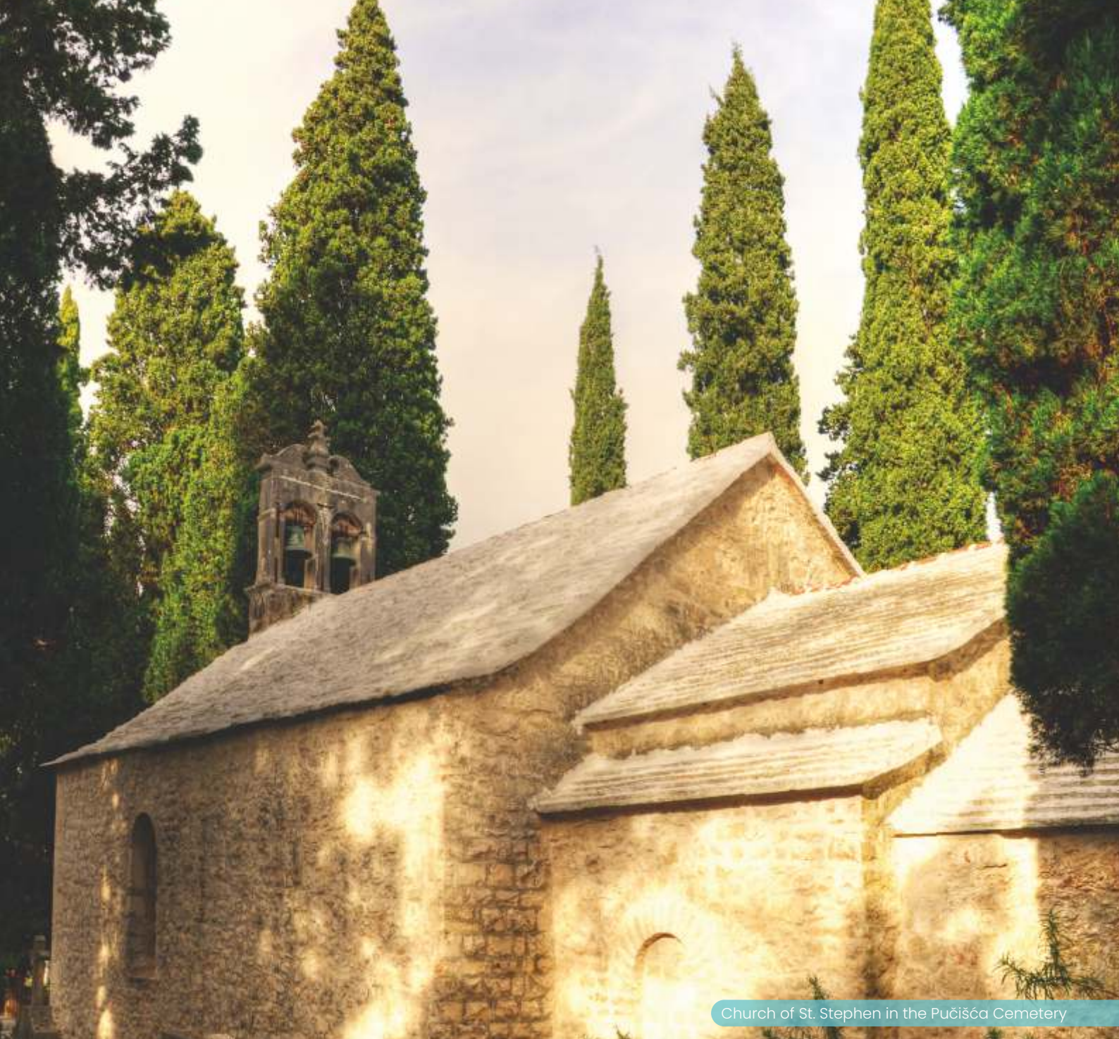
Church of St. Stephen in the Pučišća Cemetery

The peace of the Illyrians was disturbed by the Romans who, after bloody wars in the second century, finally took control of this area. As a reward, their soldiers would receive fertile lands by the sea where they built their villas and sanctuaries. The remains of Roman buildings were found near the present-day Pučišća cemetery. In the following centuries, pagan sanctuaries were converted into Christian ones. On the same place arose the early Christian basilica of St. Stephen's, and later the Benedictine and Augustinian monasteries. Along the foundations of the church of St. Stephen, you can still see the stone baptistery from the 6th century. Old Pučišća emerged around the church and monastery, and another settlement emerged in a similar way around the former church of St. Hyginus in the western part of Pučišća bay. Those places by the sea soon came under attack by various pirates, so their inhabitants retreated to the interior of the island.