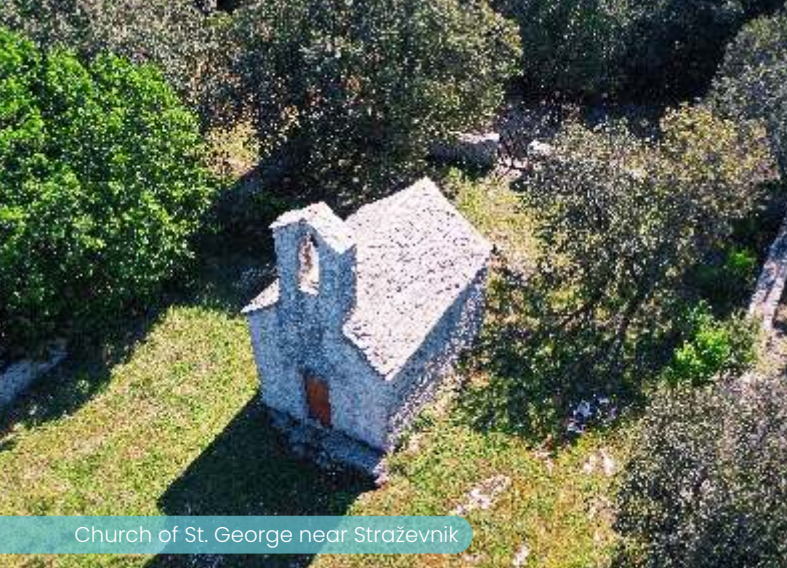
Church of St. George near Straževnik