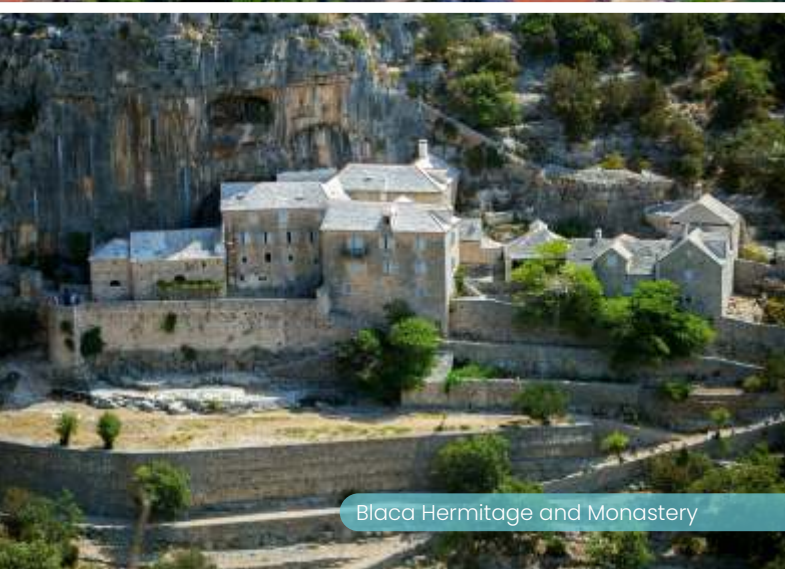
Blaca Hermitage and Monastery