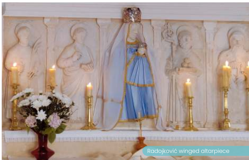
Radojković winged altarpiece