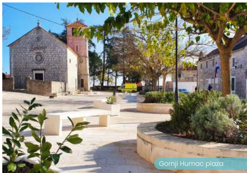
Gornji Humac plaza