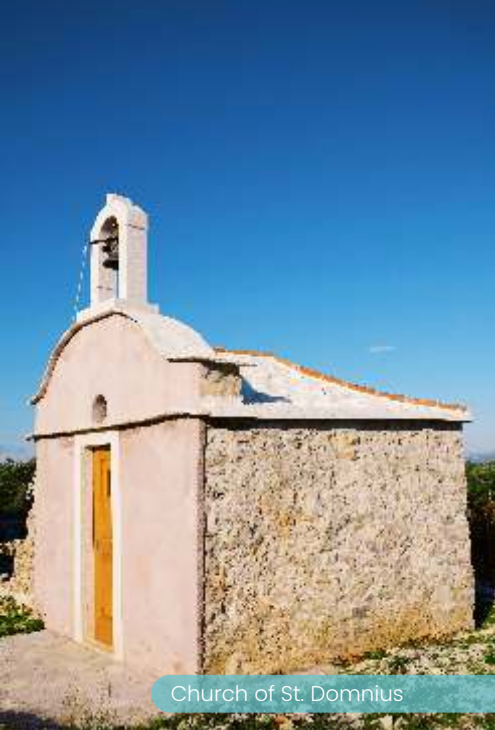
Church of St. Domnius