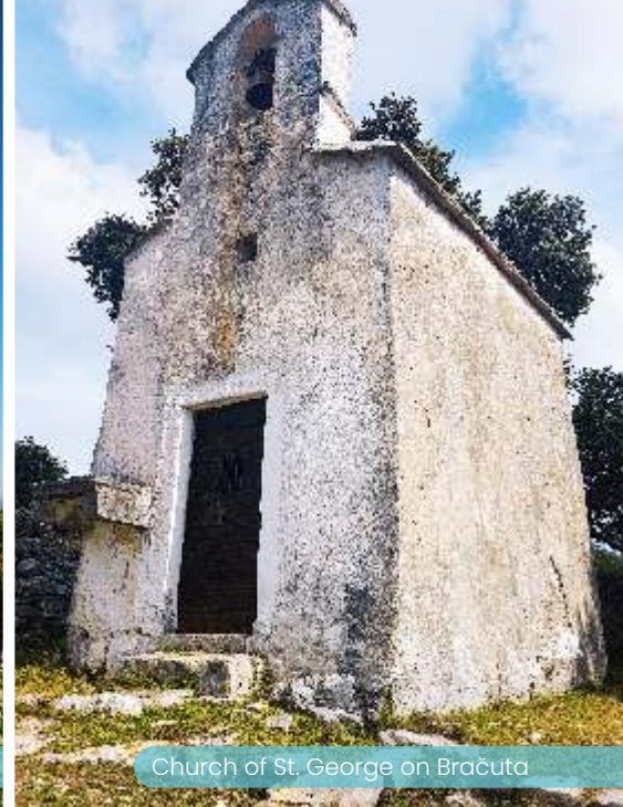
Church of St. George on Bračuta