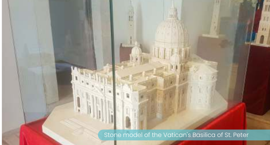
Stone model of the Vatican's Basilica of St. Peter