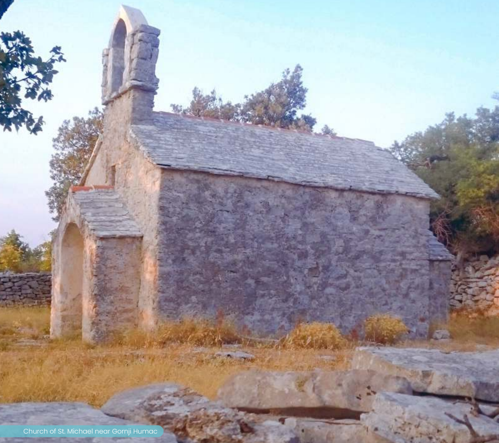
Church of St. Michael near Gornji Humac

Immediately after the foundation of the parish in 1566, construction of the new parish church of St. Jerome began. Its bell tower, completed in 1768, is one of the most striking motifs. In the area of Pučišća, Pražnica and Gornji Humac, you will find as many as 22 larger or smaller churches and dozens of chapels that the hardworking people of Brač built over the centuries as a permanent symbol of faith, hope and gratitude. Marked footpaths lead to them. Whichever path you take, you'll feel as if you're disappearing into a story where the past, present and future are intertwined. Seduced by the scents of the Mediterranean, the old field roads will lead you through well-kept vineyards and olive groves, and the blows of the wide hoes hitting the rocky soil will sound like the song of an old farmer working for a drop of oil, a drop of wine.