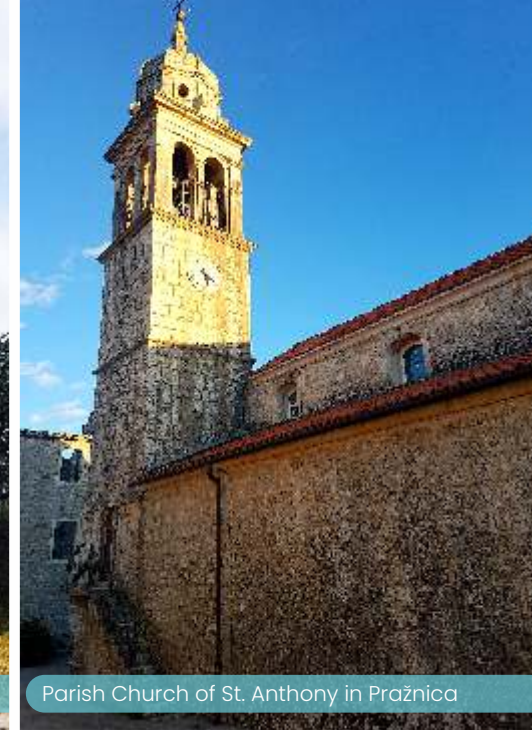
Parish Church of St. Anthony in Pražnica