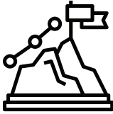
ALIGN YOUR MISSION

Chamber partnerships provide access, marketing, and visibility. Position your company message to community leaders throughout Central Texas. Partner levels align your company with purpose driven programs to create a high level of engagement. Partner benefits are outlined for each tier level.