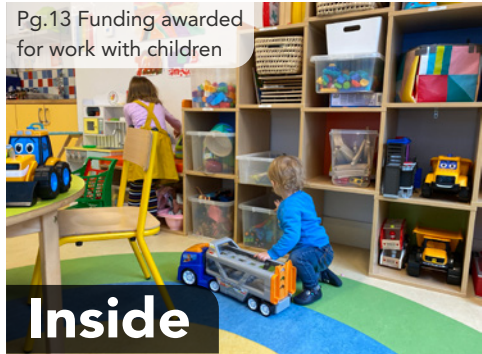
Pg.13 Funding awarded for work with children