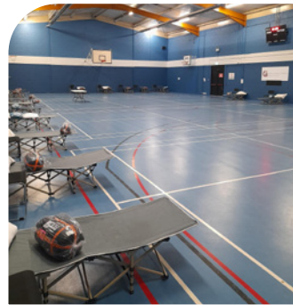
Severe Weather Response emergency set up