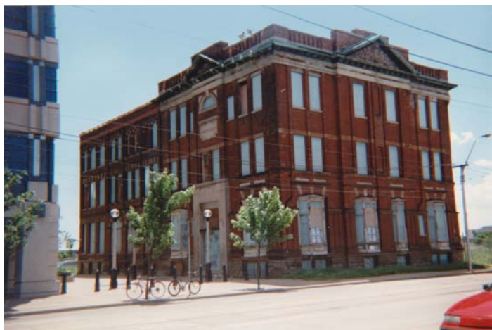
The Massey Bldg. on King Street, 1990s

And where those industrial empires once flourished are whole new orogenies of urban development. They seem solid now ... but give them a hundred years, no, fifty years , and we'll see!