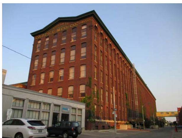
Toronto Carpet Mfg. King Street, 2015