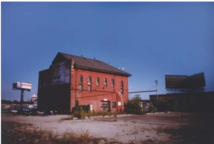
The Old Inglis Building, sometime in the 1990s

Satisfied that I could view the old Inglis building again from any imaginable angle by just clicking on a file, I resumed my journey.