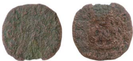
Charles I, AE Rose Farthing

Curiously enough, I had other coins of Charles I, and adding a farthing to the sixpence, shilling and half-crown I already had made good sense. It looks marginally better to the human eye than this computer scan would indicate.