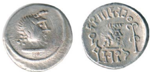
Himyarite 1/2 AR Denarius

The coin is not as sophisticated as Greek or Roman coins of the time, which was roughly contemporaneous with Julius Caesar, but it is not unattractive. The inscription is in some local script that is so obscure that I've already forgotten everything I knew about it.