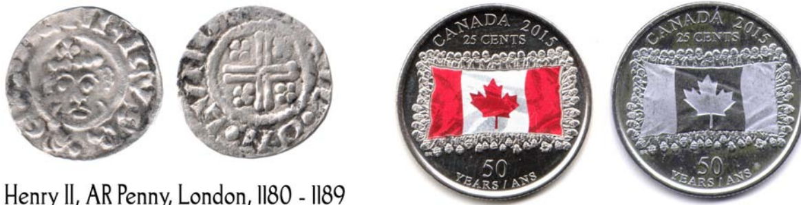
Henry II, AR Penny, London, 1180 - 1189

The Henry II coin was listed as Fine, which means it's in pretty decent condition, considering it didn't cost hundreds of dollars. You can read most of the inscription, and distinguish a certain style about it. Style is important with early English pennies, but I'll come back to that point later.