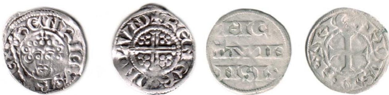
John I AR Penny, 1199 - 1216 Richard I AR Denier 1189 - 1199 AD

Unfortunately, I have no coins to fill the gap between Edward I and Henry VI, another span of about 150 years. A silver penny by either Edward III (1312 to 1377), or Henry V (1413 to 1422), would be a good place to start ...