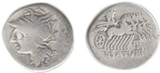
Republic AR Denarius 104 BC L. Appuleius Saturninus

Notice, though, the proofing mark – a circular punch that has ringed the eye on the obverse side, making it appear as though “Rome” wore glasses. Such marks on early Roman coins are very common – evidently bankers and businessmen did not trust the coins that passed through their hands to be silver all the way through. Masses of surviving counterfeits, with copper or bronze slugs under a thin layer of silver, attest that their suspicion was well founded. I have one or two such “fourees” – a French word meaning “stuffed” – myself.