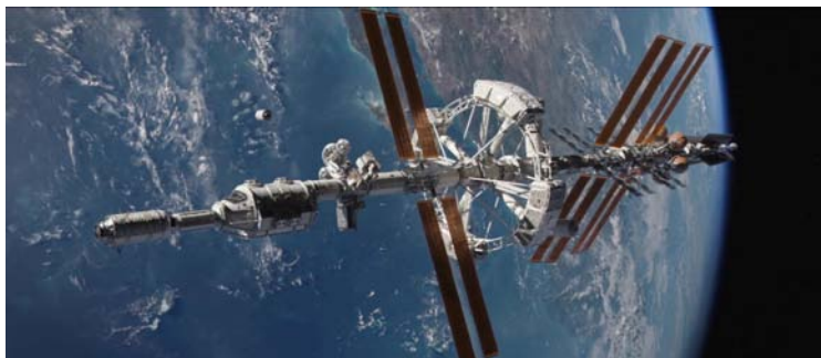
Ares III spacecraft from The Martian

In fact, that is one of the more clever parts of The Martian . The author was well aware of the advantages of artificial gravity and the Ares III, manned spacecraft is equipped with a rotating wheel-section. Neil DeGrasse Tyson commented that it ought to be rotating about three times faster ... but that is assuming it creates Earth-like gravity. The speed of the rotating section is probably about right for Martian conditions.