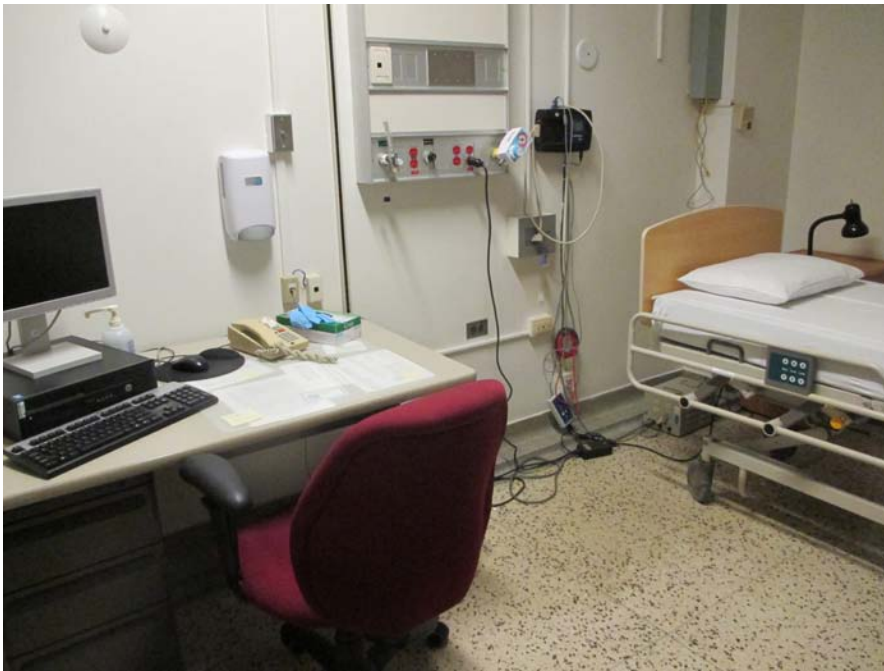
The sleep lab

Peter treated him with greater respect after that.