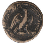
HADRIAN AE QUADRANS (OR SEMI) ROME 121-122 AD