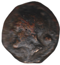
REPUBLIC AE GRAVE UNCIA ANONYMOUS 225-217 BC (2)