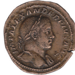
SEVERUS ALEXANDER AD 222-235 AE SESTERTIUS, ROME