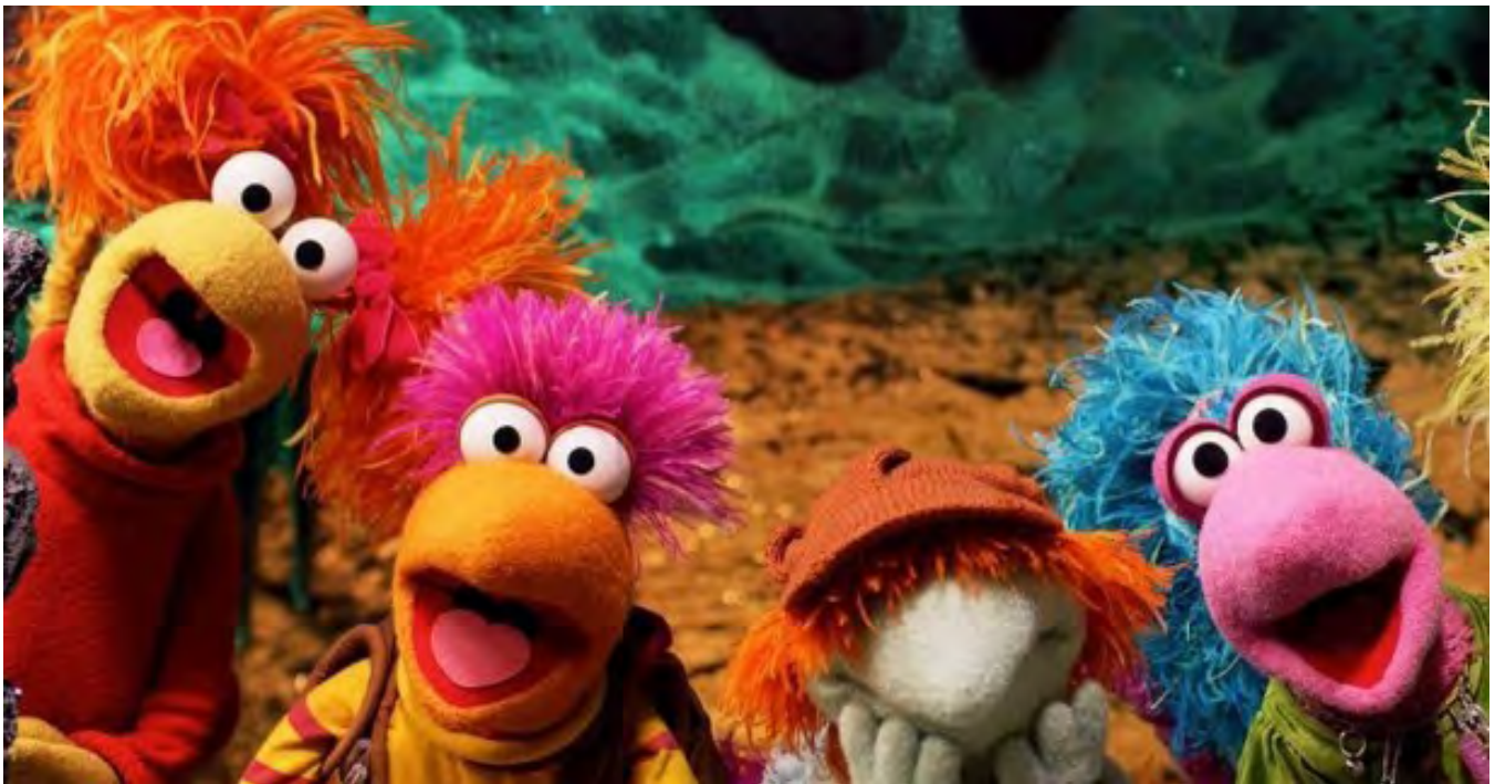
Red, Gobbo, Boober, someone impersonating Mokie and Wembley Fraggles

There is one more thing that I may as well get out in the open. Jim Henson and his crew created Fraggle Rock . His heirs didn't. They inherited the rights and may think they understand the wonderful, beautiful thing that was Fraggle Rock . Maybe they don't. It wouldn't be the first time. The heirs and assigns have owned the show for 38 years, and done nothing with it. Now they want to revive it like some Frankenstein's Monster? Maybe it's time for me to come out and claim Fraggle Rock for my own. Maybe the muses intended for me to have it, to see that it is protected and preached to the world it should be. God smite down the blood-sucking lawyers and undeserving heirs, and give Fraggle Rock to me and all the other fans!